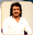
Sri. Upendra Famous Actor & director