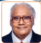
Dr. C.N.R. Rao Scientist