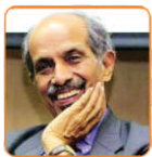
Sri. Roddam Narasimha Scientist